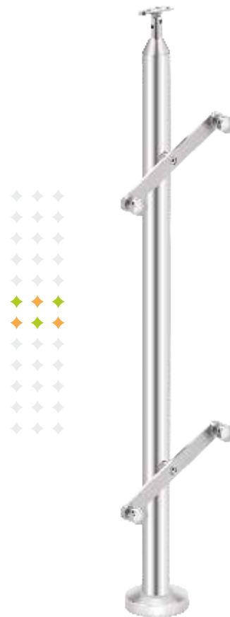
OR-03 38Ø pipe