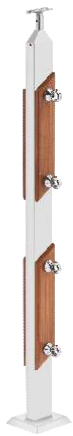
OR-59 50 X 25 Rec. Pipe