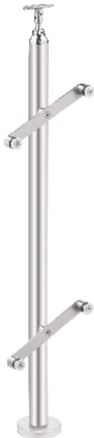
OD-02 38Ø Pipe