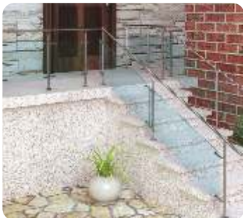
Royal Steel Series

✦ In Royal series, company not comprises in weight, look & dimensions.