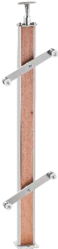
OD-51 3/4Ø Pipe