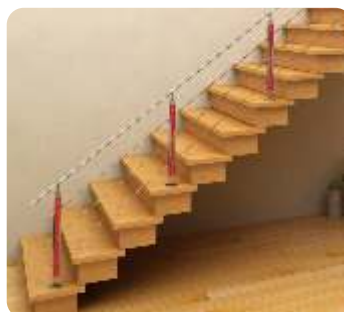
Deluxe Wooden Series