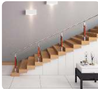
Royal Wooden Series