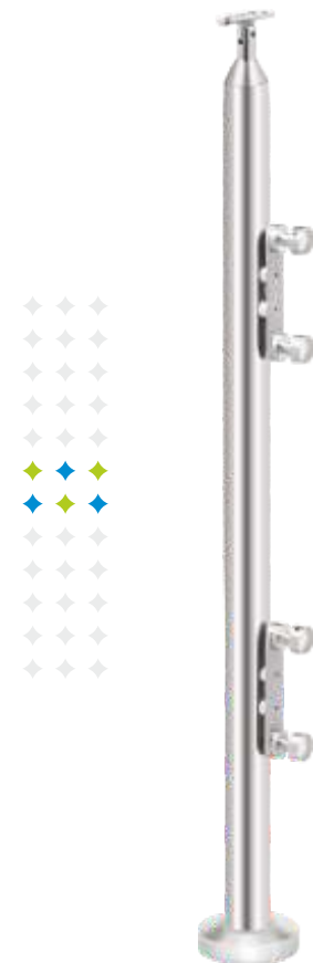
OR-04 38Ø pipe