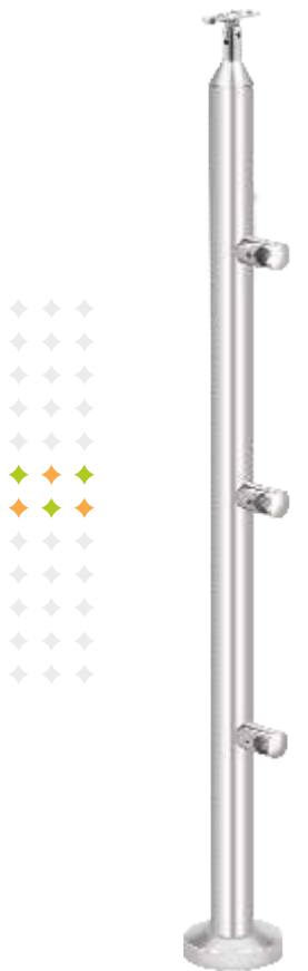
OR-01 38Ø pipe