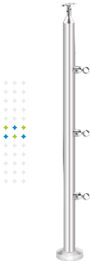
OR-02 38Ø pipe