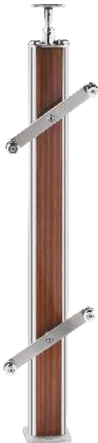
OR-56 25Ø pipe