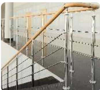
Deluxe Steel Series

✦ In Deluxe series, company makes it affordable.