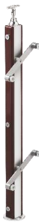
OD-53 40 X 40 Sq. Pipe