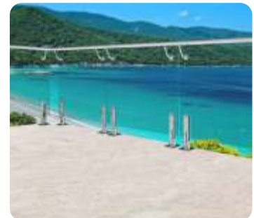
Royal Glass Series