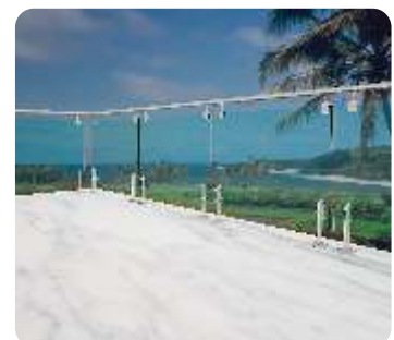
Deluxe Glass Series