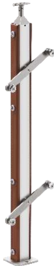
OR-58 40 X 40 Sq. Pipe